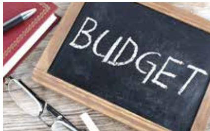
Page 40 Budget