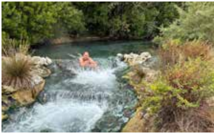
Page 20 A Bath in Greece