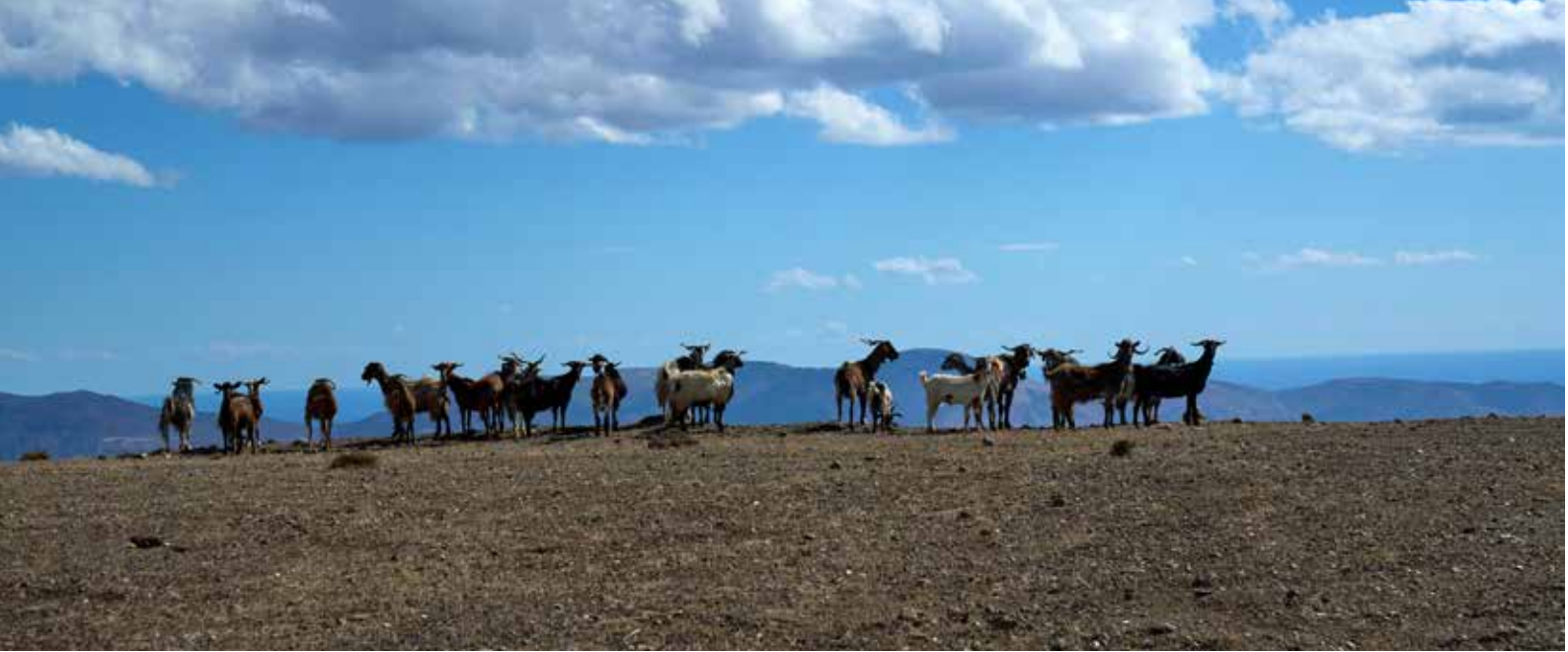
GUARDED – They are guarded.

After a few days, the weather changed from "pure sunshine" to "epically dramatic". Rain, fog, temperature plunge. At higher altitudes, it even snowed, and our plan to climb the highest mountain was unceremoniously buried. So down we went to lower, milder climes where the roads were at least halfway visible again. But even in the northern Peloponnese, we found numerous brilliant hiking opportunities, abandoned villages and lost places to explore, as well as little roads to drive.