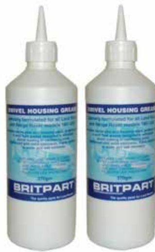
THE DOSE – The Original "One Shot" from JLR and the Most Popular Single-Dose Offerings for Smooth Moments Under Your Landy.