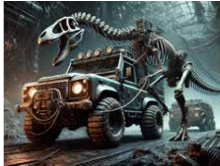
Page 38 Dinosaur in the tank.