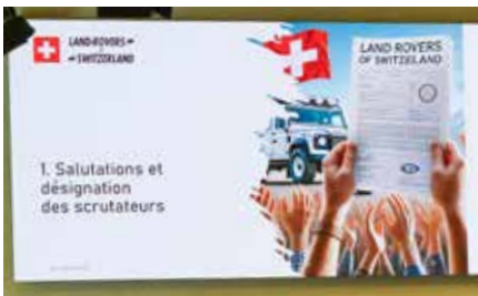
Page 12 Annual General Meeting