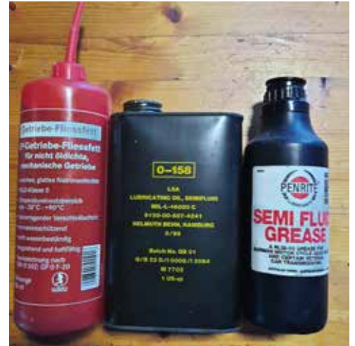
VARIANTS – The "One Shot" advisory sticker in the engine bay serves as service information. Mother's best saucepan is ideal for heating the grease. On the right we see alternative options with semi-fluid gear grease, in the centre the military variant.

very early on, designed to noticeably reduce leakage at the chrome balls whilst still ensuring proper lubrication of the joints and bearings.