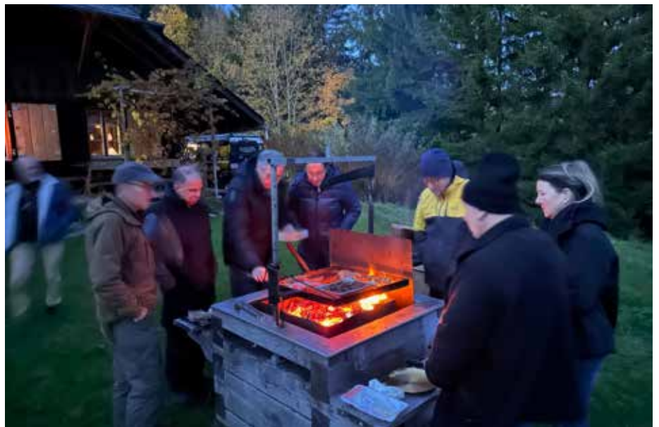
COSY – The event could hardly have been cosier. Whether in terms of pitch or barbecue..

Some traditions change, but the most important ones remain—just like our faithful Landys, which simply keep going, year after year, adventure after adventure.